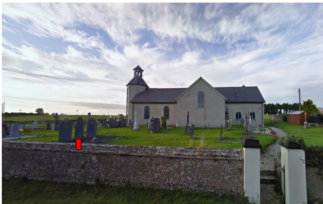
St John's Catholic Churchyard, Powerstown

St John's Catholic Churchyard, Powerstown contains only one Commonwealth War Grave.